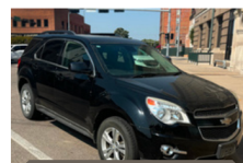
2013 Chevy Equinox