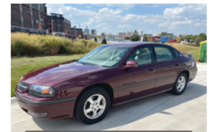
2003 Malibu Just over 27,000 miles!