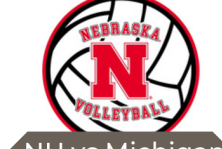
NU vs Michigan Volleyball tickets!