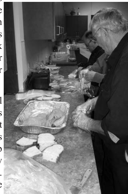
Volunteers prepare sandwiches for the CSS lunch program in Lincoln

People come to Catholic Social Services for different reasons in the summer. Sure, people still need help with rent and utilities and food, but some just stop in our offices for a bottle of water and to sit in the air conditioning for a few minutes. The number of sandwiches we give away in Hastings and Lincoln will rise during the summer months. The number of homeless people sleeping outside increases and so we will see more requests for bedrolls and blankets. It is easy to forget about the poor during the summer because at least it is warm outside. But the struggle to get by occurs every day, 365 days a year- it knows no seasons. It's easy to remember to pray for the poor and homeless when the wind chill is -30°, please remember them in your prayers this summer as well.