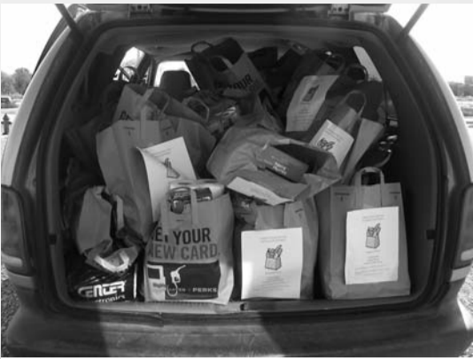
2,399 families were served by the St. Francis Food Pantry in our Lincoln office

will continue all through these cold winter months for those who need them.