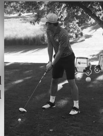
284 golfers took part in the 19th Annual CSS Memorial Golf Classic & Auction