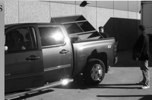
CSS Is US! Used Furniture & Appliance Drives were held in the spring and fall

provided 18,409 nights of housing to 44 families including 55 children. Also, 19 families graduated to permanent housing in 2015.