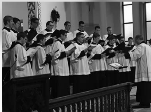
The choir from St. Gregory the Great Seminary performs at Carole Fest!

◆ The St. Francis Food Pantry in Lincoln served 8,398 individuals (2,399 families) food pantries with 184,756 pounds of food valued at $235,144.