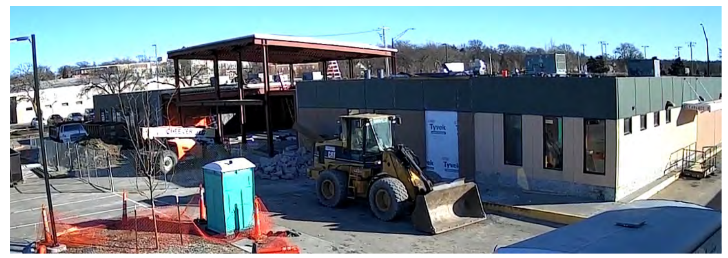
Hope in the Good Life