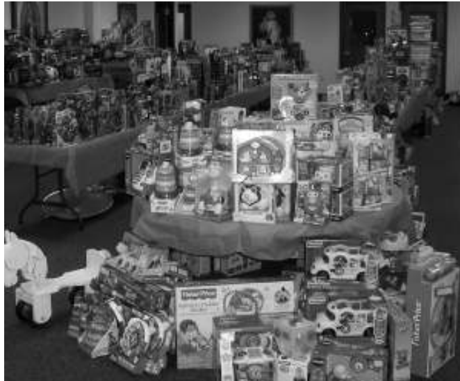
The CSS St. Nicholas Toy Shoppe as it appeared last year just before it is opened to our clients to shop