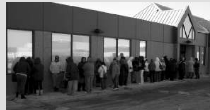
Clients line up for the St. Nicholas Toy Shoppe at the Catholic Social Services St. Joseph Center in Lincoln