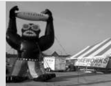
We held our annual Friar Works! fireworks tent in Lincoln this past July 3rd & 4th

Imperial, Sutton, Harvard, Clay Center, Minden and Orleans.