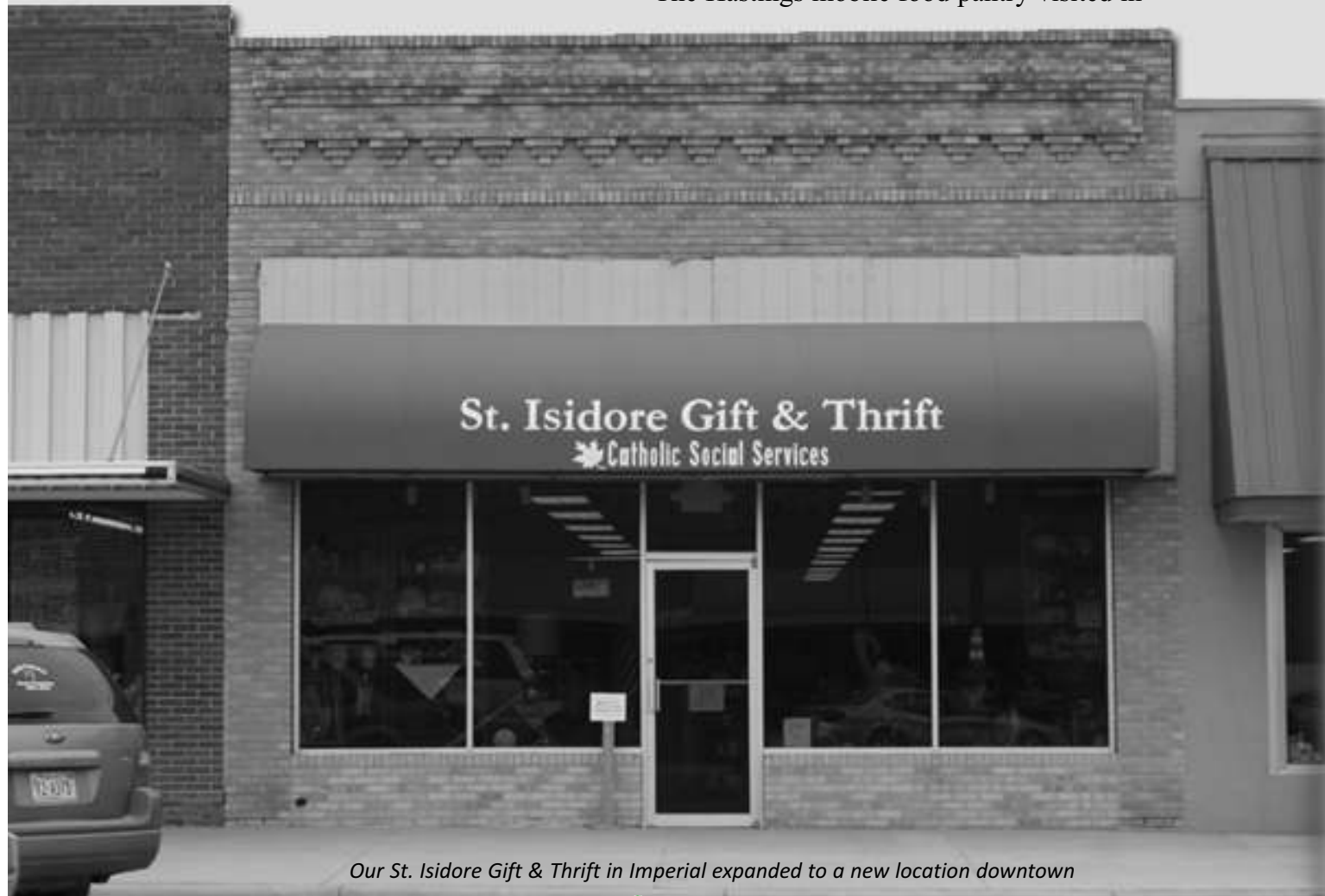
Our St. Isidore Gift & Thrift in Imperial expanded to a new location downtown