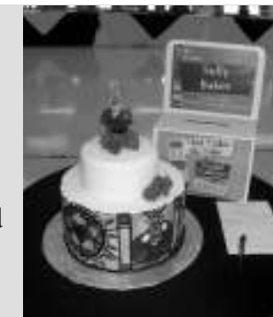
"That Takes the Cake! A Frosted Fundraiser for St. Gianna Women's Home" was held in October