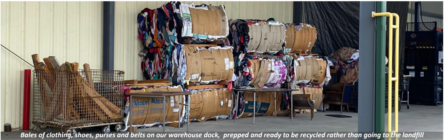
Bales of clothing, shoes, purses and belts on our warehouse dock, prepped and ready to be recycled rather than going to the landfill