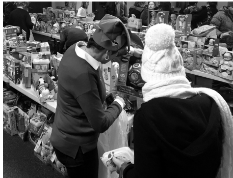
A CSS elf assists a client at last year's St. Nicholas Toy Shoppe

◆ Adopt-A-Family. Individuals, families and groups can adopt a family. Mostly gifts are purchased, but a food basket can be given. The maximum value of each gift is $25 per person.