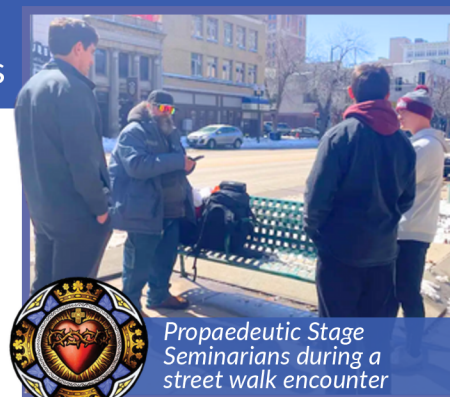
Propaedeutic Stage Seminarians during a street walk encounter