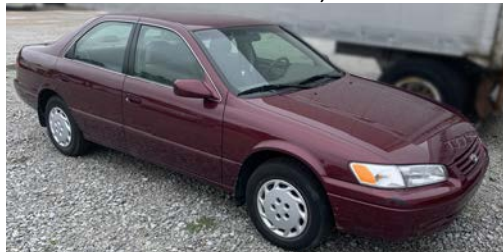
You can bid on this 1998 Toyota Camry that has just over 40,000 miles!

www.qtego.net/qlink/csshastings . Please support our work by bidding on some awesome gifts, trips, packages, and items such as a 1998 Toyota Camry that has just over 40,000 miles!